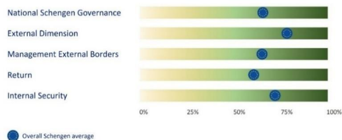
Aggregated Scoreboard of December 2025

The 2025 Schengen Scoreboard (60) paints a diverse picture of how Member States contribute to the functioning of the Schengen area: