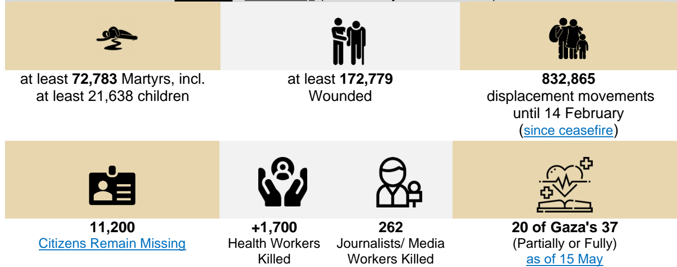
Figure 1: Gaza Strip (Since Early October 2023)