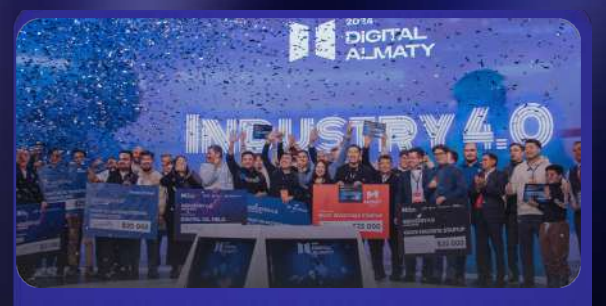
Startup competition in a battle format