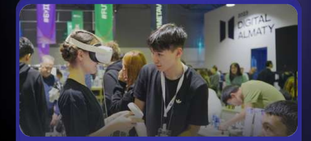
Exhibition of digital projects and technological solutions

Panel discussions with Kazakhstani and international speakers