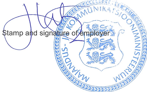
Stamp and signature of employer