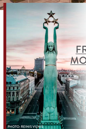
THE FREEDOM MONUMENT