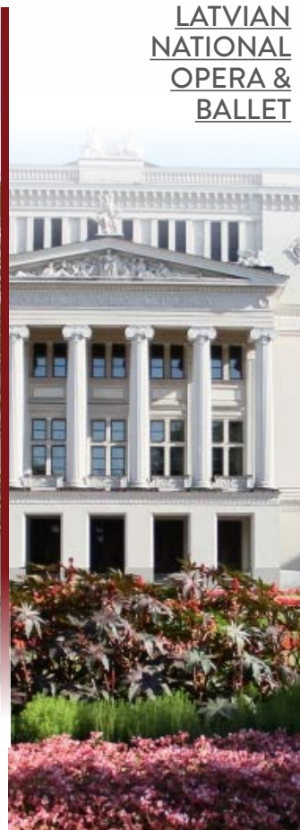
LATVIAN NATIONAL OPERA & BALLET