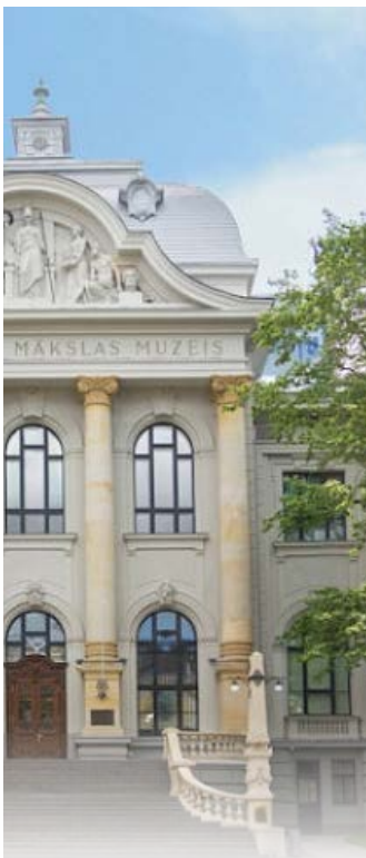
LATVIAN NATIONAL MUSEUM OF ART