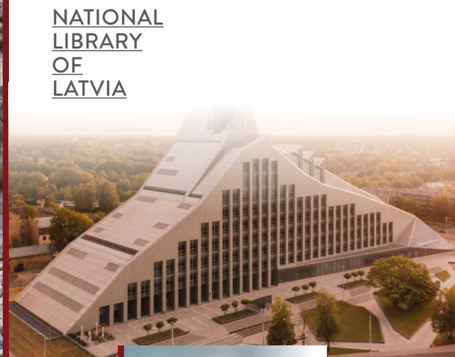
NATIONAL LIBRARY OF LATVIA