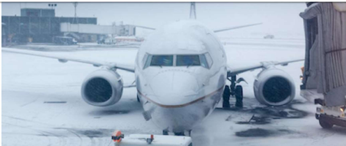
Airplane on the runway during winter weather.

1-1-2 BUSINESS MAASSLUIS SCHIPHOL AIRPORT CANCELLATIONS FLIGHT CANCELLATIONS